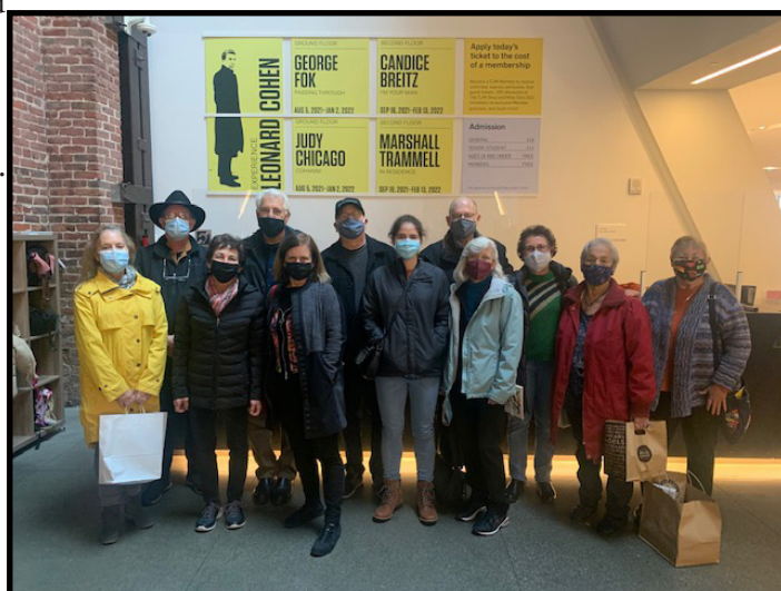
A group visited the Contemporary Jewish Museum's Leonard Cohen exhibit in December.