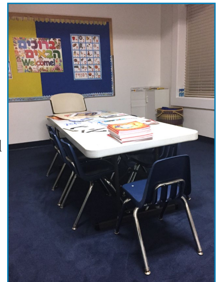
Ready for the new school year!