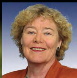
CONGRESSWOMAN ZOE LOFGREN